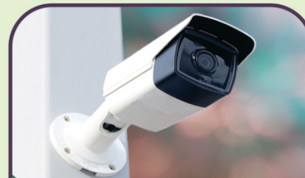
CCTV Surveillance System