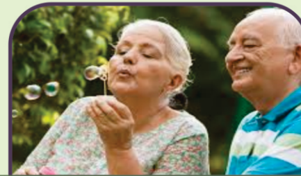
Senior Citizen Park