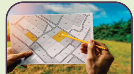
Each Plot Demarcation